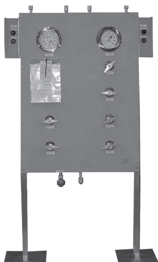
Single Gas Filling Panel Part Number: 300-822628